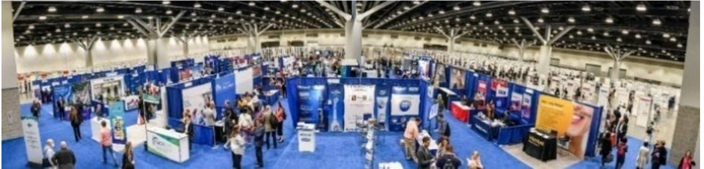
Exhibit sales are open now! Don't miss this unique opportunity to forge new connections with decision makers who approve product development and R&D budgets for products.

Learn more by visiting our Exhibits & Sponsorship page or email exhibits@iadr.org for more information.