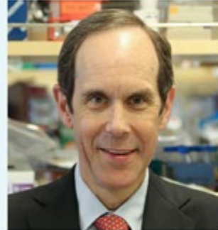
Brian J. Druker